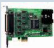
PX-279: PCIe 8xRS232 1MBaud