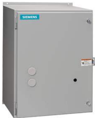
Contactor LE,400A,0NC,3NO,480V Contactor LE,400A,0NC,3NO,480V