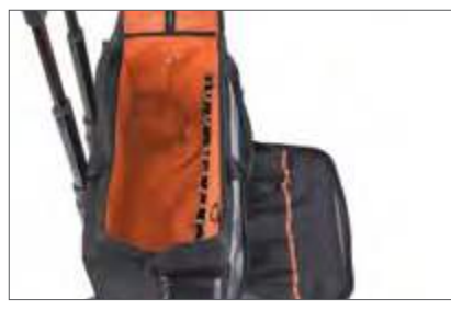
Wide open interior to accommodate large tools.