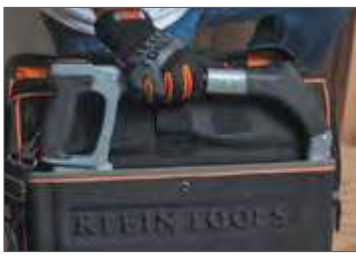
Top-loading hacksaw pocket with protective plastic lining.