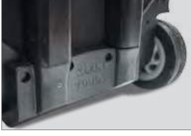
Molded kick plate to protect from the elements.