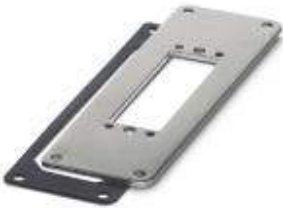
The illustration shows version HC-B 24-ADP-VC-3

Adapter plates 2 mm thick, for panel cutouts of HC-B 24 size, including 1.5 mm flat gasket, size 2