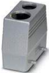
HEAVYCON B16 sleeve housing, for double locking latch, height: 76 mm, with 1 x M32/1 x M25 thread, straight cable outlet

Please be informed that the data shown in this PDF Document is generated from our Online Catalog. Please find the complete data in the user's documentation. Our General Terms of Use for Downloads are valid ( http://download.phoenixcontact.com )