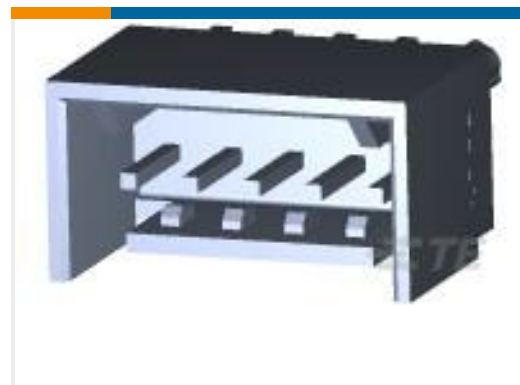
TE Part #2-644486-5 05P MTA100 SHRDED HDR ASSY SN