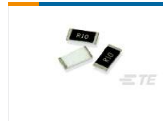
TE Part #4-2176055-4 RLP73K 2B R62 1% 1K RL