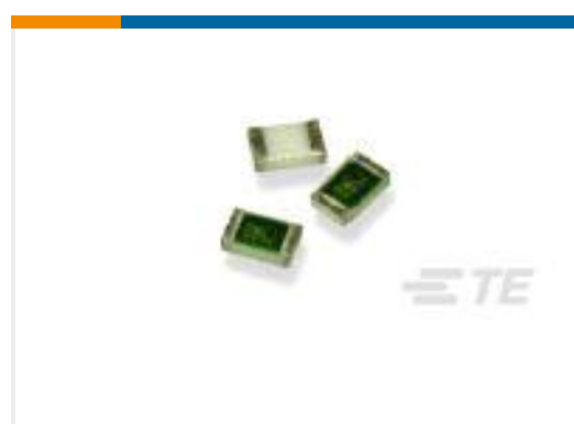
TE Part #5-1614882-0 CPF 0603 15K 0.1% 25PPM 5K RL