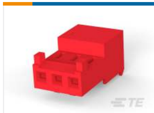
TE Part #3-643813-8 Nylon Tin Plated Receptacle: 2.54 mm, with Mating Alignment, MTA 100