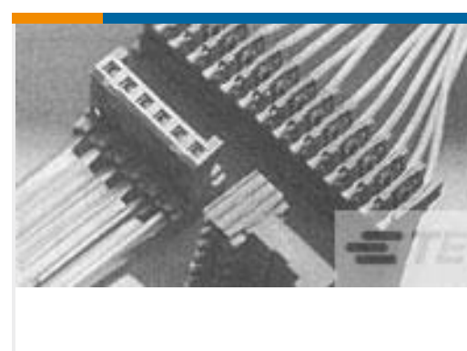
TE Part #144270-4 PLUG HE14 IDC 90 4 P AWG 24