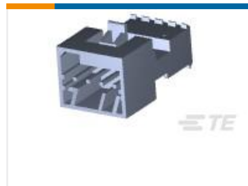
TE Part #647000-4 04P MTA100 PSTD CONN ASSY SN