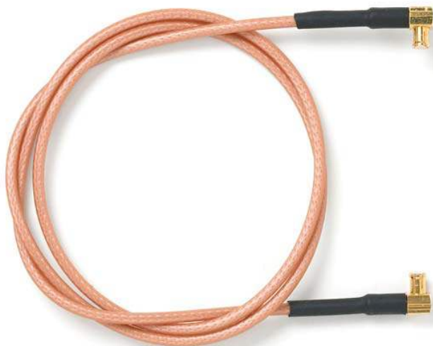
Model 73068 MCX Right-Angle Plug to MCX Right-Angle Plug, RG316/U

Snap-on coupling and miniature size for fast connect and disconnect where space is limited