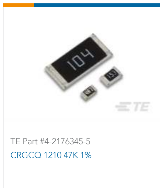
TE Part #4-2176345-5 CRGCO 1210 47K 1%