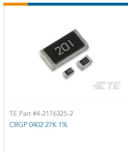
TE Part #4-2176325-2 CRGP 0402 27K 1%