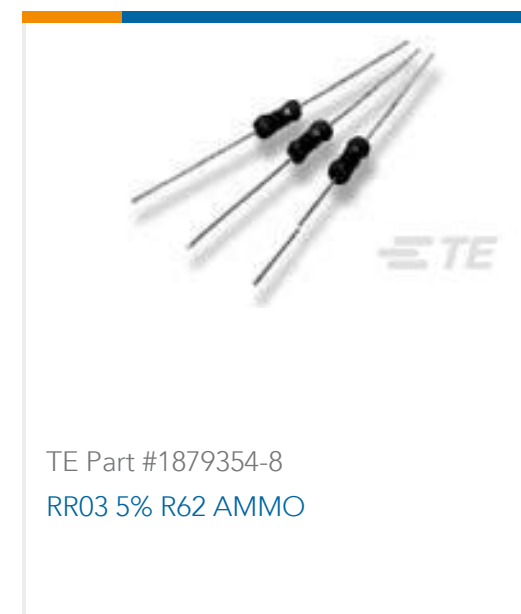
TE Part #1879354-8 RR03 5% R62 AMMO