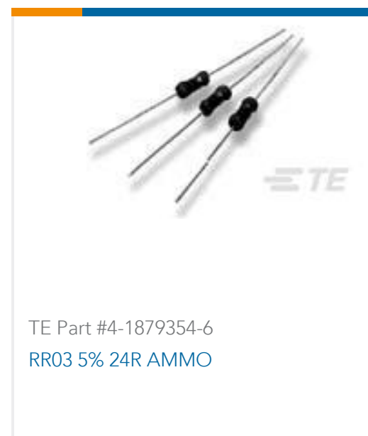
TE Part #4-1879354-6 RR03 5% 24R AMMO