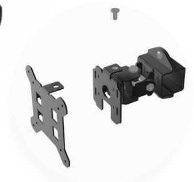
Detachable VESA pattern mounting plate!