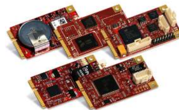
Mini PCIe Modules