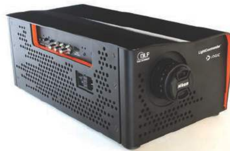
DLP LightCommander Development Kit

The DLP LightCommander takes DLP development to a new level. The fully self-contained kit benefits developers looking to