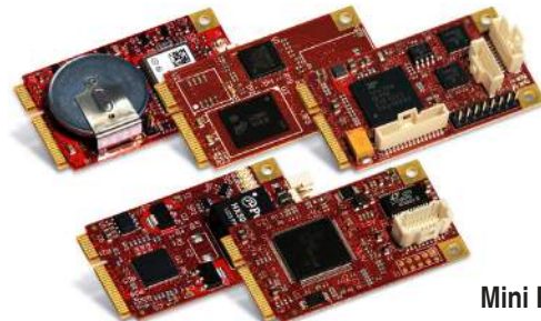
Mini PCIe Modules