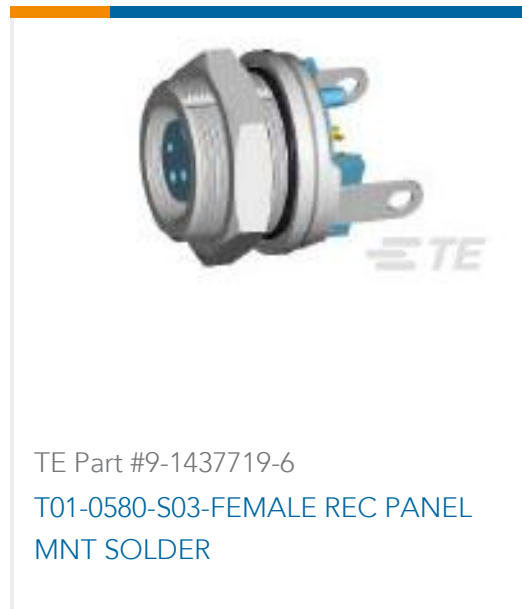
TE Part #9-1437719-6 T01-0580-S03-FEMALE REC PANEL MNT SOLDER