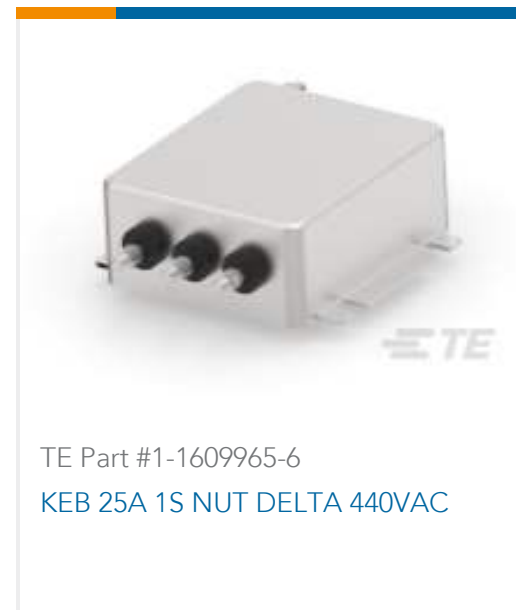
TE Part #1-1609965-6 KEB 25A 1S NUT DELTA 440VAC