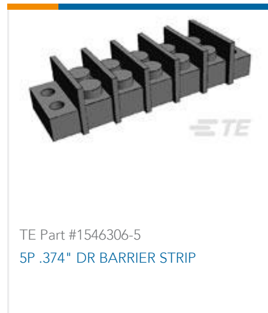
TE Part #1546306-5 5P .374" DR BARRIER STRIP