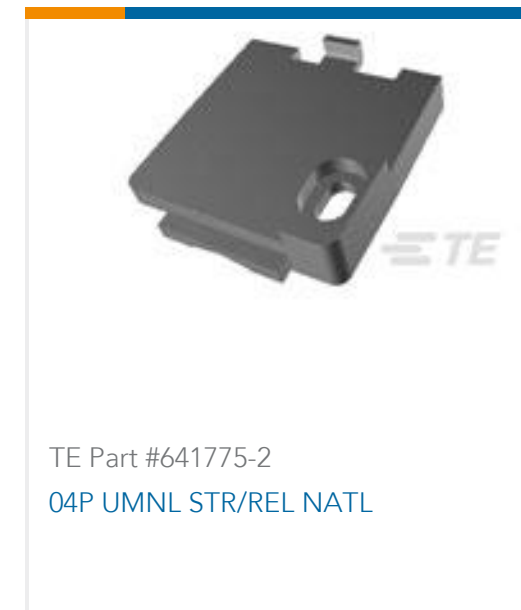
TE Part #641775-2 04P UMNL STR/REL NATL