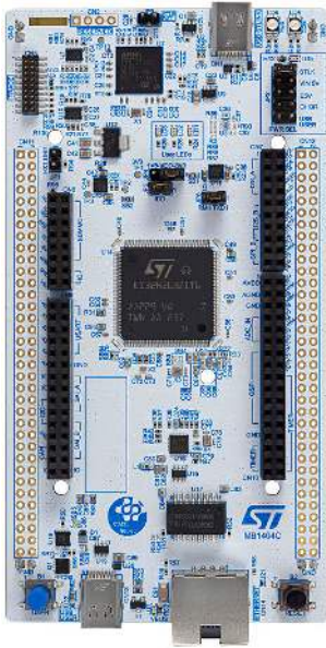
NUCLEO-H563ZI example. Boards with different references show different layouts. Picture is not contractual.