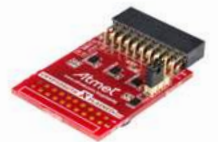
CryptoAuth Xplained Pro