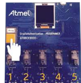
AT88CK9000 Just press the big yellow button to program five devices at the same time.

The Atmel AT88CK9000 allows programming of small device batches of device quickly, easily, and cost-effectively. This option decreases the cycle times of prototype, pre-production, and lower-volume production, improving time to market. The AT88CK900 securely programs up to five devices at the same time. Running production is literally as easy as pressing a button.