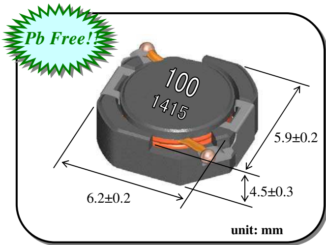
Image & Dimension