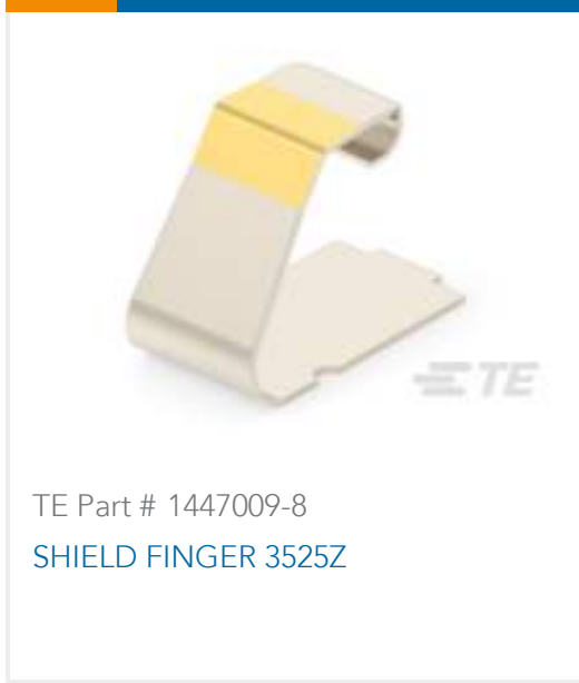
TE Part # 1447009-8 SHIELD FINGER 3525Z