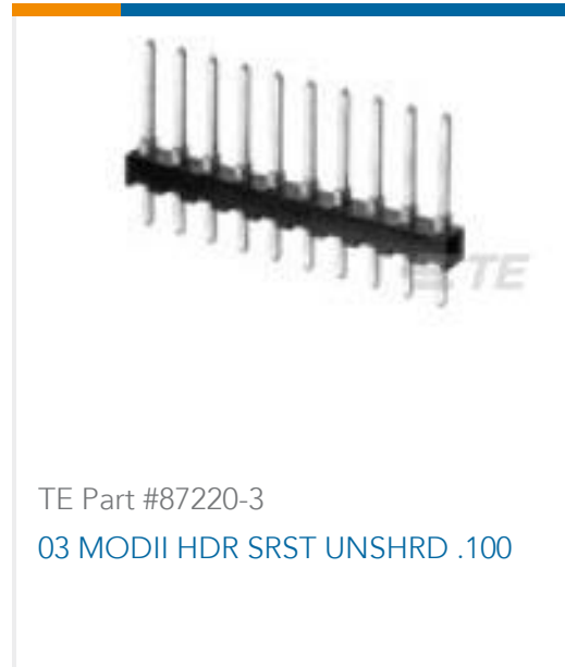
TE Part #87220-3 03 MODII HDR SRST UNSHRD .100