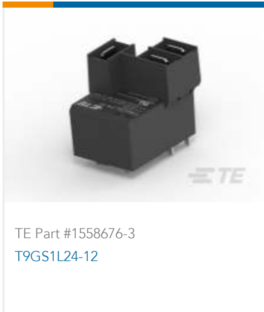
TE Part #1558676-3 T9GS1L24-12