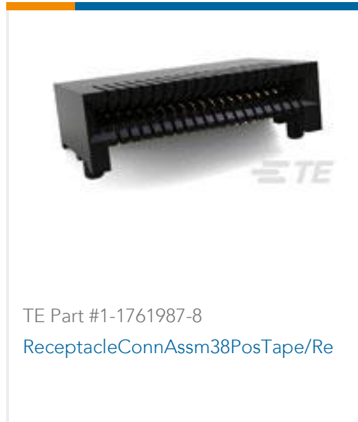
TE Part #1-1761987-8 ReceptacleConnAssm38PosTape/Re