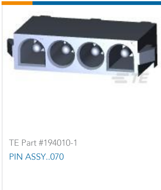
TE Part #194010-1 PIN ASSY..070