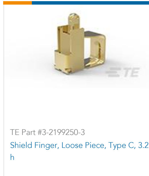
TE Part #3-2199250-3 Shield Finger, Loose Piece, Type C, 3.2 h