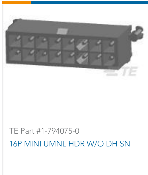
TE Part #1-794075-0 16P MINI UMNL HDR W/O DH SN