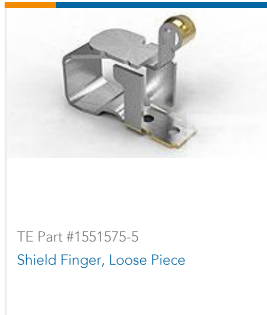
TE Part #1551575-5 Shield Finger, Loose Piece