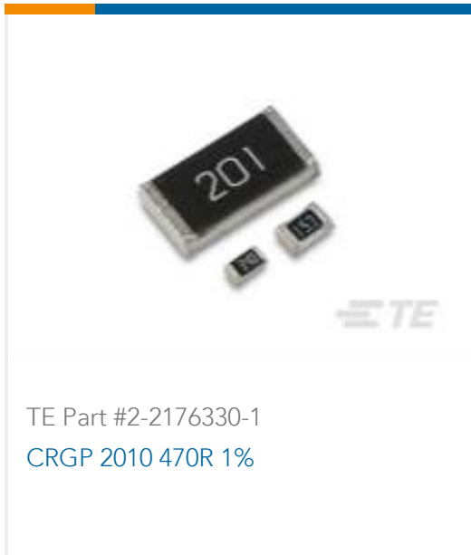
TE Part #2-2176330-1 CRGP 2010 470R 1%