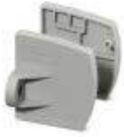
Flange cover, Color: gray