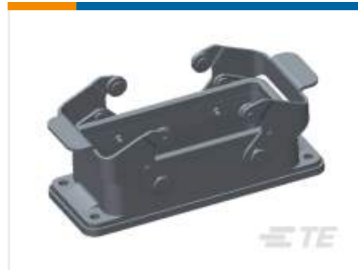
TE Part #T1410161000-000 H16B-AGS