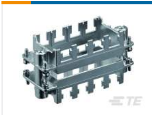
TE Part #T2070164001-000 H16BN-T4