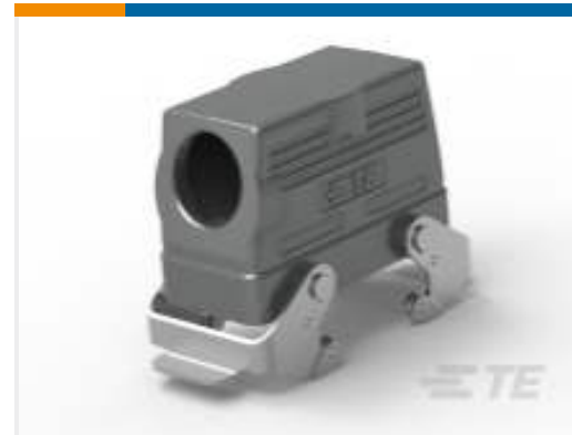
TE Part #T1250163121-000 H16B-TSBS-PG21