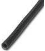
Galvanized steel protective hose with PVC coating

Protective hose - WP-STEEL PVC C 10 - 3240867