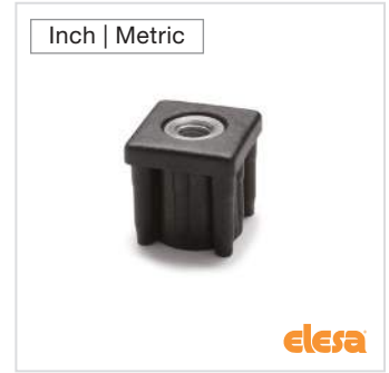
ELESA original design NDX.Q