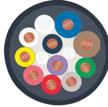
PUR/PVC black [PUR]