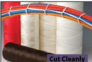
Cut Cleanly Scissors

Cable lacing - easy to learn, quite inexpensive, looks more attractive, and is a superior method of bundling wires in your boat.