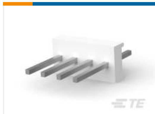
TE Part #3-641126-8 PCB Header: Polyester, Vertical, Unshrouded, No Mating Alignment