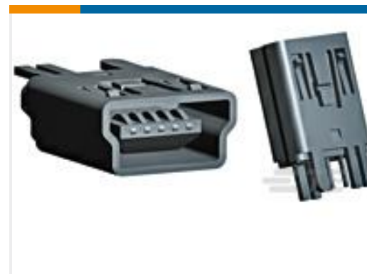
TE Part #1734753-1 MINI USB, TYPE B, VERTICAL, T/H