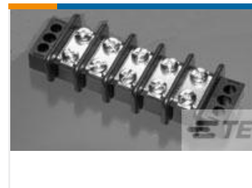
TE Part #1546311-6 6P .563" DR BARRIER,W/WASHER