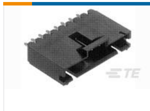
TE Part #1-103638-5 16 MTE HDR SRST LATCH .100CL