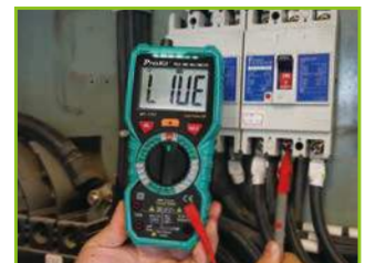
Live wire test