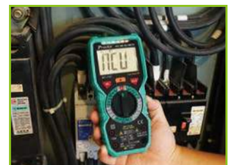
Non contact voltage detector