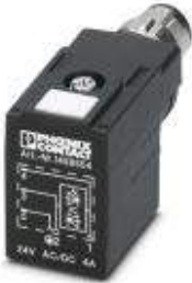
Valve connectors, 3-position, Plug angled M12, A-coded, on Valve connector B (10 mm), with 1 LED, connected with Z diode

Please be informed that the data shown in this PDF Document is generated from our Online Catalog. Please find the complete data in the user's documentation. Our General Terms of Use for Downloads are valid ( http://download.phoenixcontact.com )