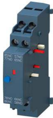
signaling switch for circuit breaker 3RV2 with screw terminal