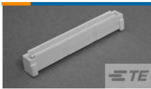
TE Part #3-5177986-1 0.8FH,P08H.5,040,08/Sn,TR,SC