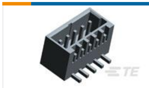
TE Part #5-1775443-4 EMIX CONN., 1.5MM PITCH, HDR, V /T, 4P