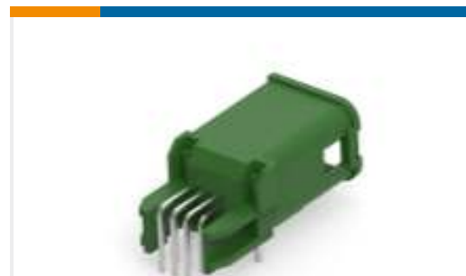
TE Part #2321376-5 6POS,TAB0.5X0.4,HDR ASSY,90DEG, COD E