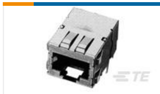
TE Part #1734509-4 RJ45,8P8C,W/LED,G/Y,50u"