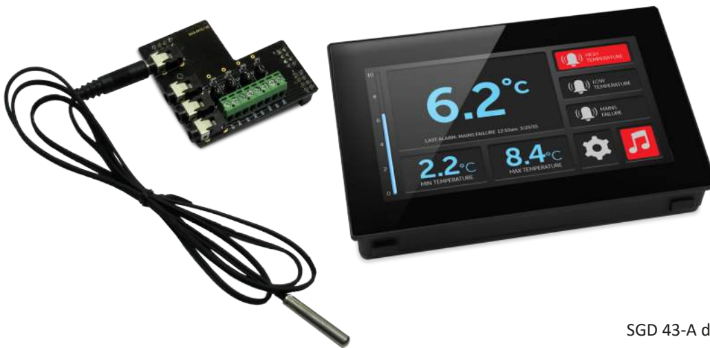
SGD 43-A display sold separately

S43-TP is a four-channel thermistor board to add temperature measurement functionality to the SGD 43-A PanelPilotACE display. Within the PanelPilotACE Design Studio software users can choose to display, log or graph the temperature inputs.