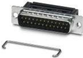
D-SUB contact insert, shell size 3, with 25 signal contacts, contact type pin, flat-ribbon cable connection, angled, fixing with a 3 mm hole, for panel mounting frame VS-25-...

Please be informed that the data shown in this PDF Document is generated from our Online Catalog. Please find the complete data in the user's documentation. Our General Terms of Use for Downloads are valid ( http://phoenixcontact.com/download )