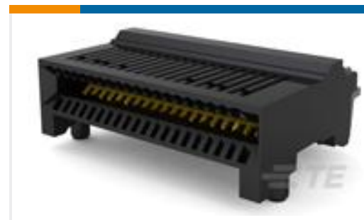
TE Part #1551920-2 zQSFP+ connector assembly