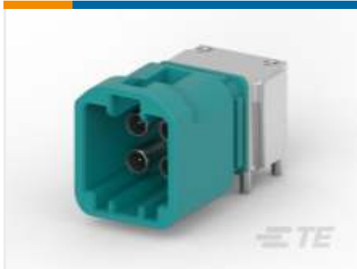
TE Part #2304168-9 4P MATE-AX, HDR ASSY, 90 DEG, COD Z