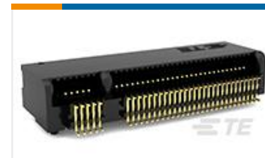
TE Part #2199230-4 M.2 0.5PITCH 4.2H KEY E 15U" AU