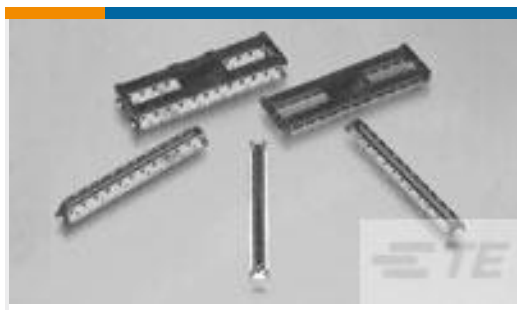
TE Part #3-1827233-6 5FHP05H,440,B,GIG,08/Sn,HT,NS