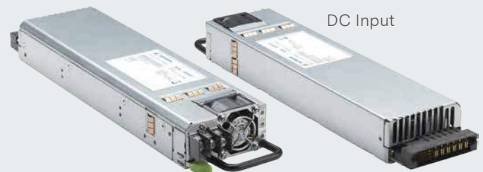
Connector input shown

Advanced Energy's Artesyn DS450DC and DS550DC series bulk front end power supplies are the DC-input versions of their DS450 and DS550 AC-input counterparts. Mechanically identical to the AC versions, these products allow system operation from a Telco style 48 Vdc input. Rated at 450 and 550 watts, the DS450/550 power supplies generate a main DC output of 12 Vdc and a 3.3 Vd for powering standby circuitry. Standard features include active current sharing, internal ORing FETs and an EEPROM for storing service data to facilitate efficient field replacement. An I 2 C communication interface is provided for the FRU EEPROM data.