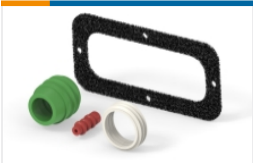
Connector Seals & Cavity Plugs (32)