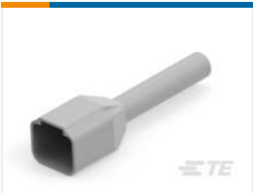
TE Part #DTP4P-BT BOOT, 4P, REC, ST, GRY