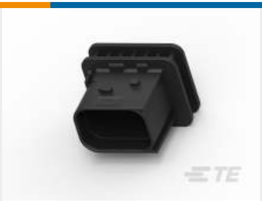
TE Part #2112301-1 PROTECTION CAP, FOR REC.HSG GROUP C