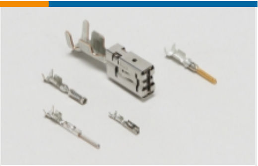
Automotive Terminals (145)