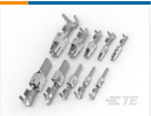
TE Part #925590-1 TIMER, RECEPTACLE AND TAB GROUP C