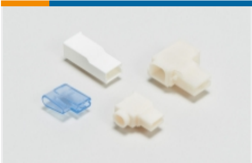
Crimp Terminal Housings (13)