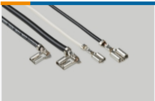
Quick Disconnects (4)