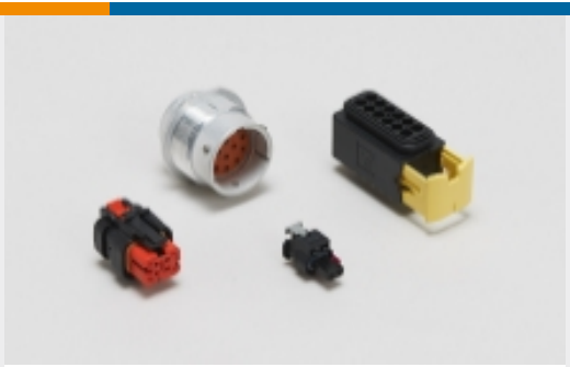
Automotive Housings (237)