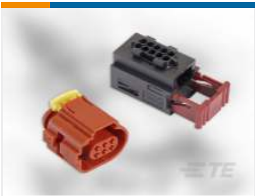
TE Part #969191-2 Timer Connector Housing