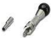
Contact removal tool for coaxial contacts