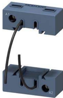
coil connection module connection diagonal, screw terminal, for contactors 3RT2.2, 3RT2.3, and 3RT2.4