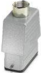
HEAVYCON sleeve housing, D15, for single locking latch, height: 66 mm, with 1 x M25 support, straight cable outlet

Please be informed that the data shown in this PDF Document is generated from our Online Catalog. Please find the complete data in the user's documentation. Our General Terms of Use for Downloads are valid ( http://phoenixcontact.com/download )