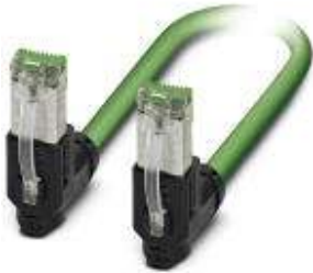
Profinet patch cable, shielded, star-quad, 22 AWG stranded (7-wire), green, angled RJ45 male connector/IP20 to angled RJ45 male connector/IP20, length: 1.0 m

Please be informed that the data shown in this PDF Document is generated from our Online Catalog. Please find the complete data in the user's documentation. Our General Terms of Use for Downloads are valid ( http://download.phoenixcontact.com )