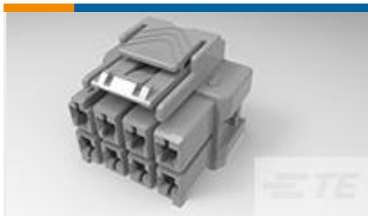
TE Part #5-1971776-4 PTL 2X4 PLUG HSG HIGH TEMP KEY A LGR