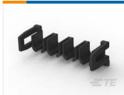
TE Part #1971777-4 Locking Plate, POWER TRIPLE LOCK, TPA