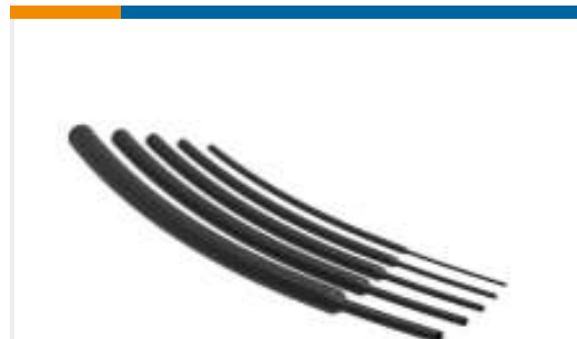
TE Part #NB13052001 RNF-100-1-BK-STK