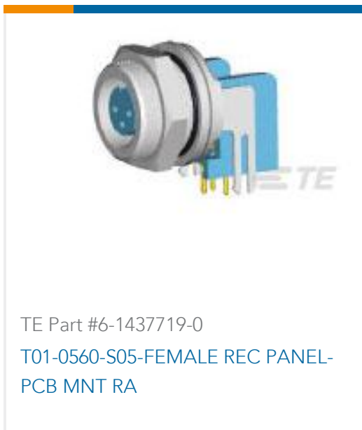
TE Part #6-1437719-0 T01-0560-S05-FEMALE REC PANEL-PCB MNT RA