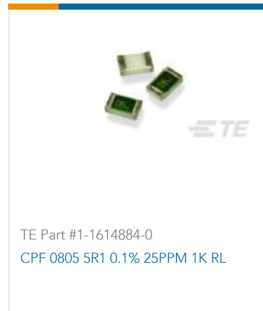
TE Part #1-1614884-0 CPF 0805 5R1 0.1% 25PPM 1K RL