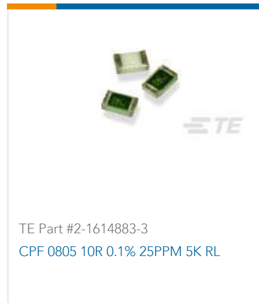
TE Part #2-1614883-3 CPF 0805 10R 0.1% 25PPM 5K RL