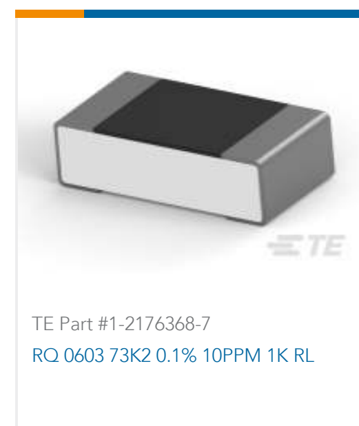
TE Part #1-2176368-7 RQ 0603 73K2 0.1% 10PPM 1K RL