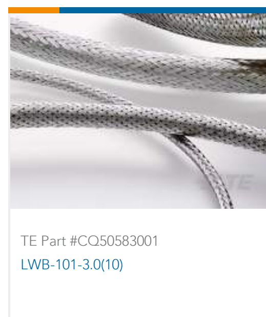
TE Part #CQ50583001 LWB-101-3.0(10)