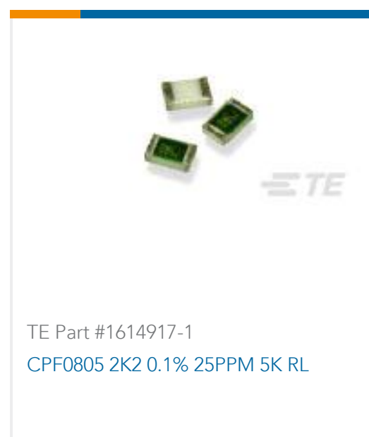
TE Part #1614917-1 CPF0805 2K2 0.1% 25PPM 5K RL