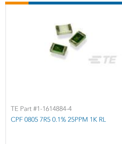
TE Part #1-1614884-4 CPF 0805 7R5 0.1% 25PPM 1K RL