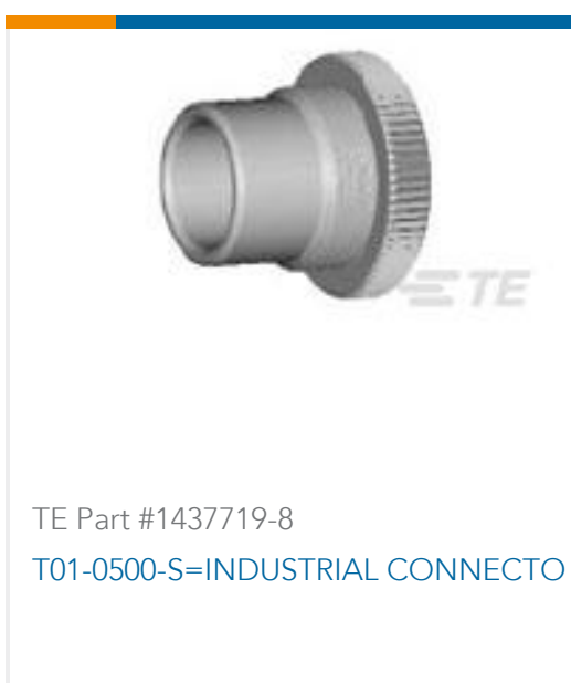
TE Part #1437719-8 T01-0500-S=INDUSTRIAL CONNECTO