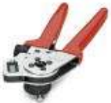
Crimping pliers with digital display

Crimping pliers with digital display - SF-Z0026 - 1607454