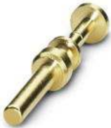
Crimp contact, turned, Single contact, Contact diameter: 3.6 mm, Crimp range: 1 mm 2 ...4 mm 2

Please be informed that the data shown in this PDF Document is generated from our Online Catalog. Please find the complete data in the user's documentation. Our General Terms of Use for Downloads are valid ( http://download.phoenixcontact.com )