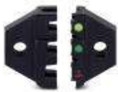
Spare die for CRIMPFOX-RCI 1

Replacement die - CRIMPFOX-RCI 1/DIE - 1212056