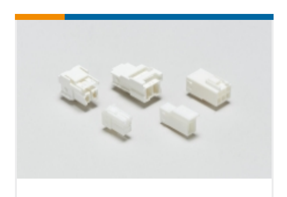
Rectangular Power Connectors(479)