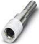
Female test connector, Color: transparent

Female test connector - PSBJ 4/15/6 FARBLOS - 0303419