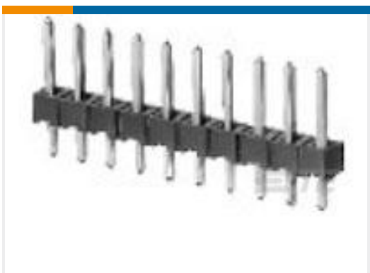
TE Part #9-146274-0 40 MODII HDR SRST B/A .100CL