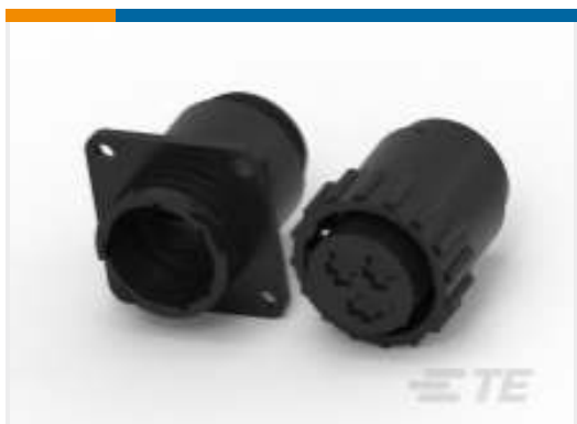
TE Part #206136-1 CPC SERIES 3