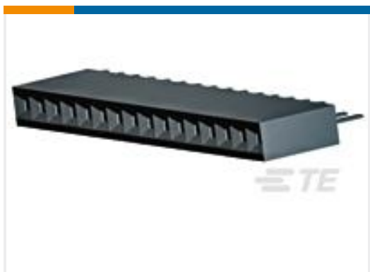
TE Part #6-534237-4 16 MODII VRT SR CE 100/115