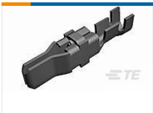
TE Part #66253-8 MALE CONTACT ASSY. (STRIP)