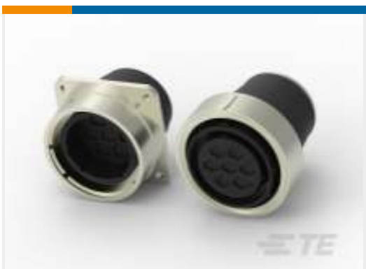
TE Part #208484-1 Circular Connector, CMC Series 3