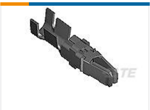
TE Part #66741-9 TYPE XII FEMALE CONT (STRIP)