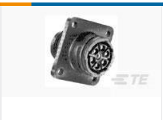
TE Part #211769-2 17-9 CPC RECEPT REV SEX