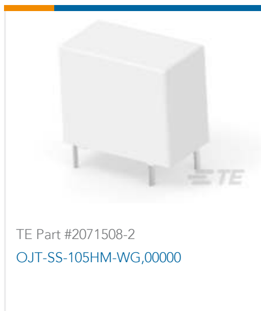
TE Part #2071508-2 OJT-SS-105HM-WG,00000