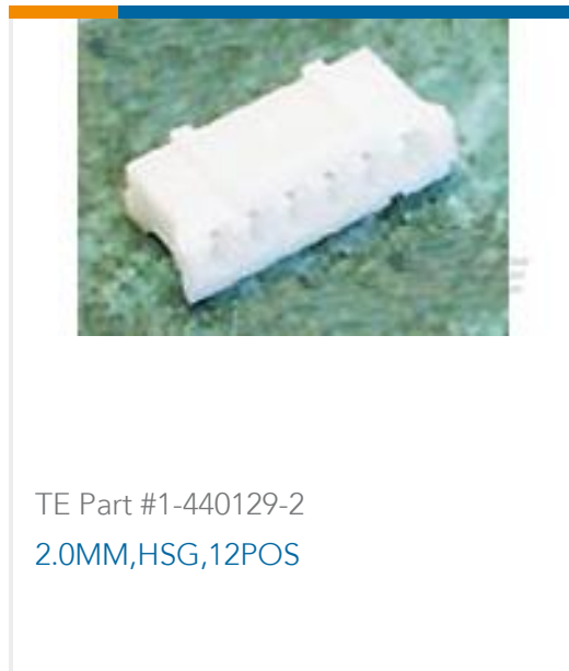
TE Part #1-440129-2 2.0MM,HSG,12POS