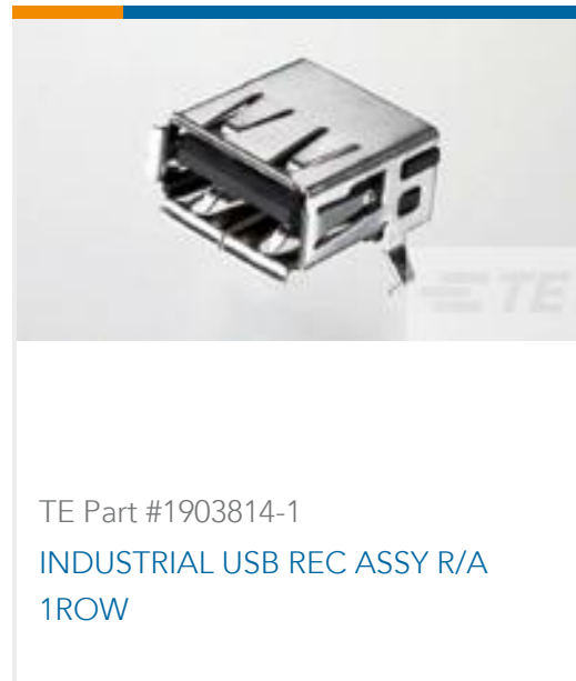
TE Part #1903814-1 INDUSTRIAL USB REC ASSY R/A 1ROW