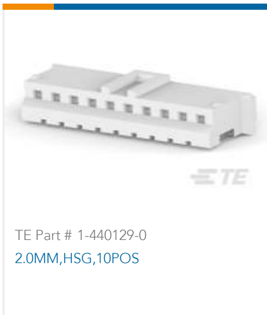
TE Part # 1-440129-0 2.0MM,HSG,10POS