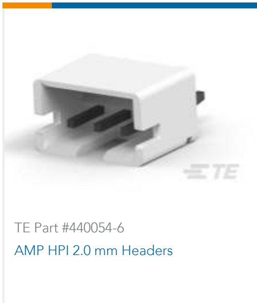
TE Part #440054-6 AMP HPI 2.0 mm Headers