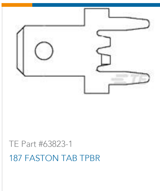
TE Part #63823-1 187 FASTON TAB TPBR