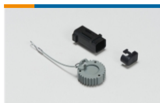
Automotive Connector Caps & Covers (5)