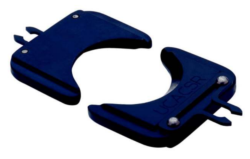
*NOTE: UCACSR SHOWN IN PICTURE ABOVE. PICTURE FOR REFERENCE ONLY.