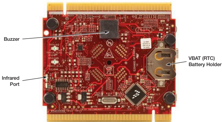
Figure 2: Back side of TWR-K20D50M board