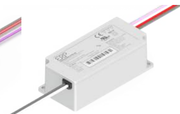
ESST Plastic Case (ESST40 only) L 84 x W 40 x H 27 mm (L 3.30 x W 1.57 x H 1.06 in)