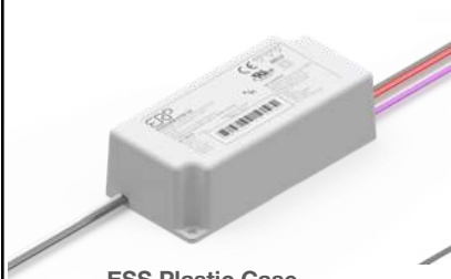
ESS Plastic Case L 84 x W 40 x H 25 mm (L 3.30 x W 1.57 x H 0.99 in)