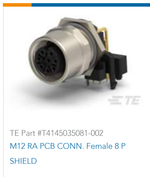
TE Part #T4145035081-002 M12 RA PCB CONN. Female 8 P SHIELD